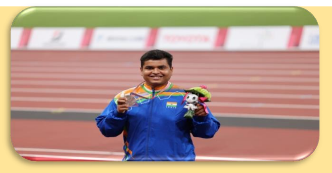
YOGESH KATHUNIYA 2019 World Para Athletics Championships