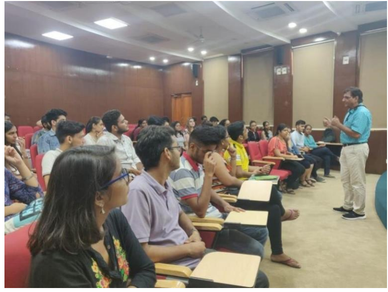
NCEARD SEMINAR 50<sup>TH</sup> NSS DAY & WOMEN CONCLAVE 24<sup>th</sup> September 2019