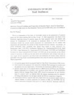
Letter 2 .jpg 152K