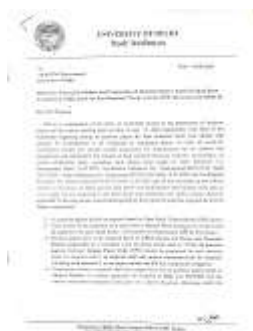
Letter 2 .jpg 152K