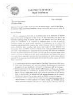
Letter 2.jpeg 152K