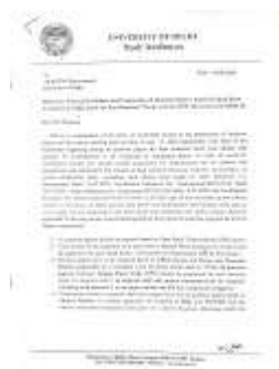
Letter 2 .jpg 152K