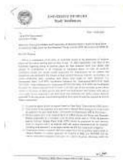
Letter 2 .jpg 152K