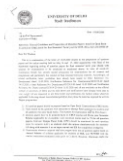
Letter 2 .jpg 152K